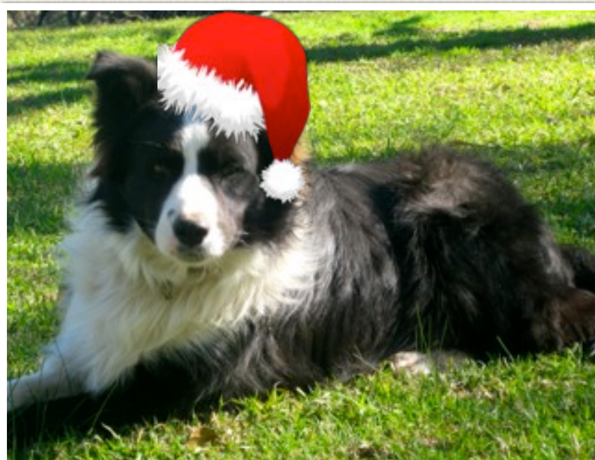
Merry Christmas from everyone at Windermere Farm