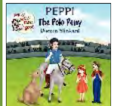
PEPPI THE POLO PONY