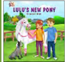
LULU'S NEW PONY