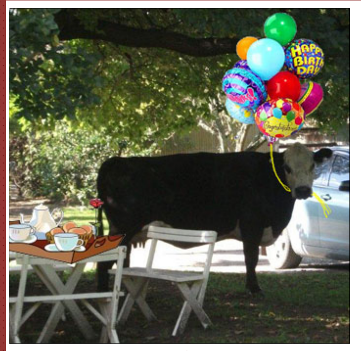
Daisy the Cow, popped in for a visit on my birthday