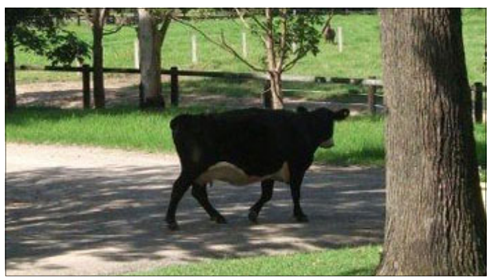
We had a cup of tea (she supplied the milk), then she left.

EYES MAGIC'S run at Goulburn and was disappointing, as once again, his track work before hand was exceptional. We hope at Wyong next Thursday he'll decide to put his best foot forward.