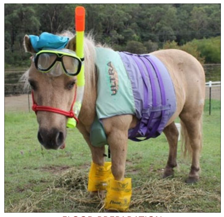
FLOOD PREPARATION Life vest, check... Floaties, check... Snorkel, check....

THE COBRA KING our very own horse has returned to work after recovering from his hair line fracture. He's now furnished into a magnificent horse and is working with a vengeance. We pray he will do his father proud, who of course is one of our favourite Stallions---GOLDEN SNAKE.