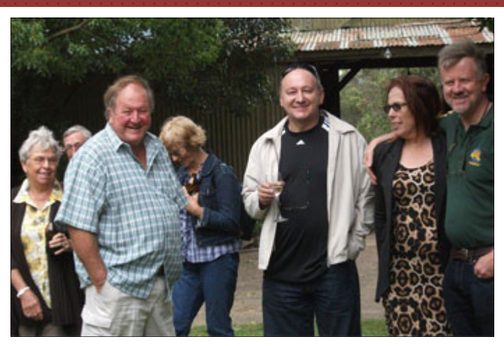
Due to the recent horrific weather we can only supply photo's of past sunny open days.