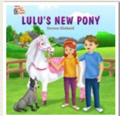
LULU'S NEW PONY