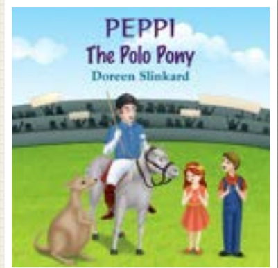
PEPPI THE POLO PONY